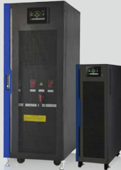
100KL/120KL/180KL / 200KL 60KL/40K(L)/30K(L)